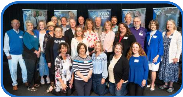
Some past & present Board and Staff

Together, we move forward with courage, gratitude, and expectation for all God will do next.