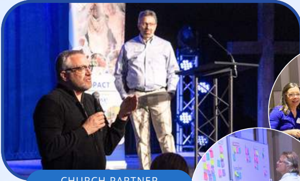
CHURCH PARTNER LUNCH IN FEBRUARY