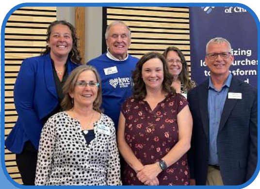
CONVERGE EVENT, MAY 14

2025 has been a busy and exciting year at Love INC, including two fruitful events with different audiences and purposes. The Church Partner Lunch in February brought pastors and leaders together to discover further ways to serve our community with Christ's love . The Vision Breakfast in May invited donors to become Vision Carriers by making a 5-year pledge to this transformational work. At both events, I shared my retirement news (which I hope you have heard by now). Love INC is strong and will reach new heights with this transition, which we expect at the end of 2025. The Love INC Board is in full swing searching for the next Executive Director. Would you please pray for the process and for the new leader God has for us?