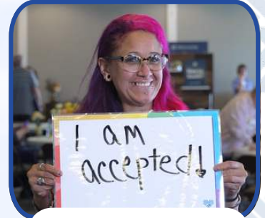
VIDEO SHOOT WITH IMPACT