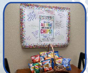
APRIL VOLUNTEER APPRECIATION FUN