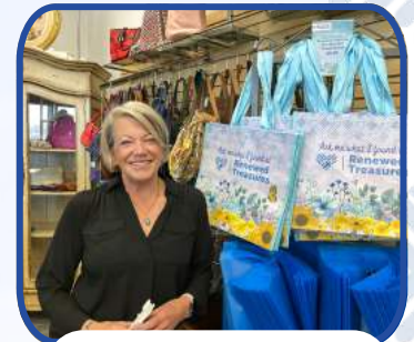
BIG SMILES ON NEW VOLUNTEERS