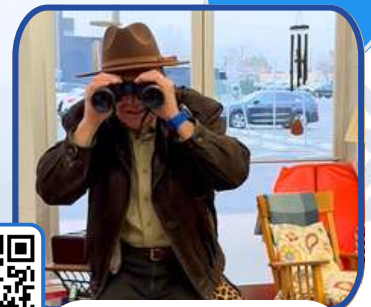
TERRY THE TREASURE HUNTER SCOUTING TREASURES