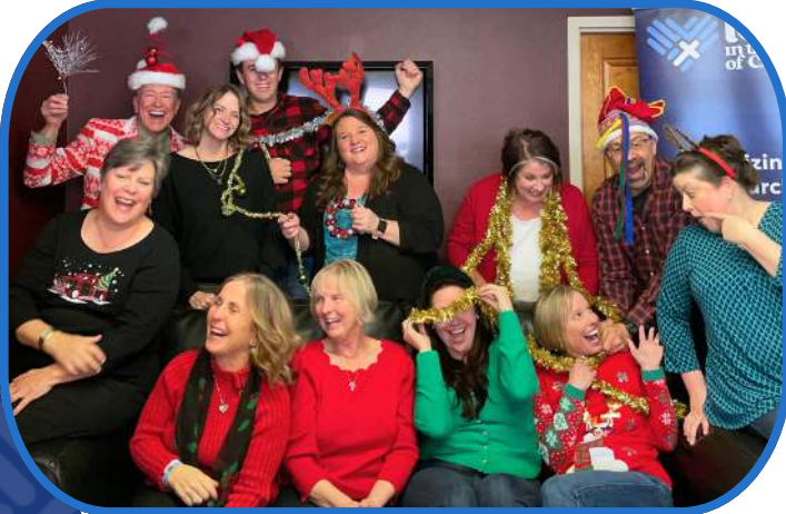
Committed to the work and having fun doing it!