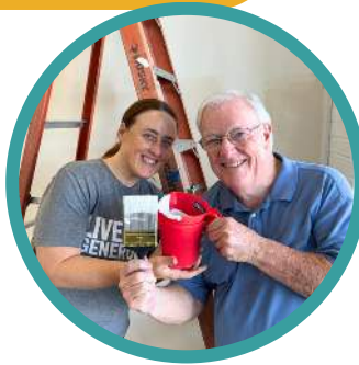
Sep. 3rd Patch & Paint efforts