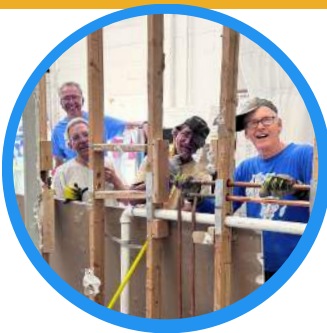
Jul. 24th Demolition began