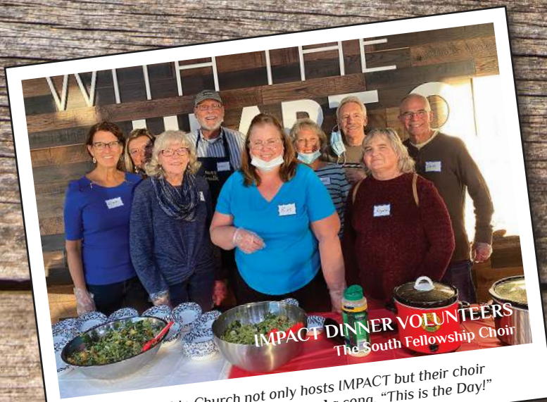
IMPACT DINNER VOLUNTEERS The South Fellowship Choir

"The Love INC staff is welcoming and kind. It has been a blessing and I enjoy my mornings at the office."